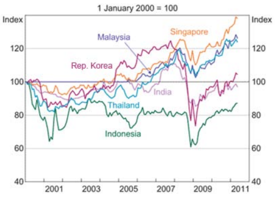
Figure 2: Selected Asian Currencies against US Dollar

Note: this figure was obtained from RBA Chartpack